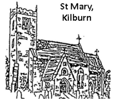
St Mary, Kilburn