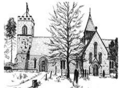
St Oswald, Sowerby