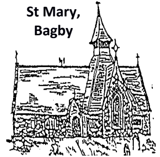
St Mary, Bagby