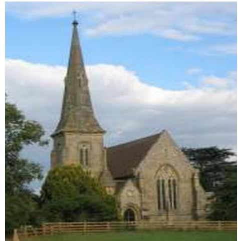
All Saints, Thirkleby