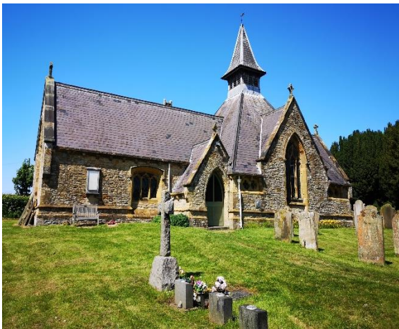
St. Mary, Bagby