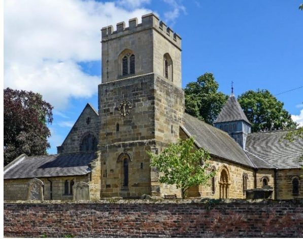
St. Oswald, Sowerby