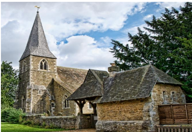
St. Cuthbert, Sessay